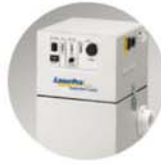
Air Extraction System