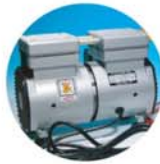
Air Compressor Unit